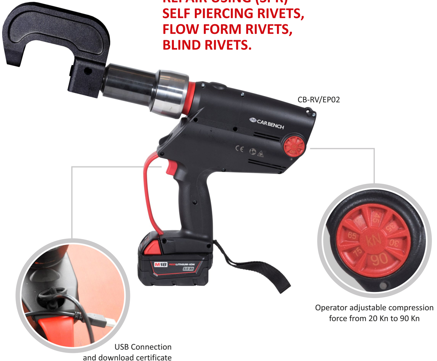
Operator adjustable compression force from 20 Kn to 90 Kn

IDEAL FOR AUTOMOTIVE REPAIR USING (SPR) SELF PIERCING RIVETS, FLOW FORM RIVETS, BLIND RIVETS.