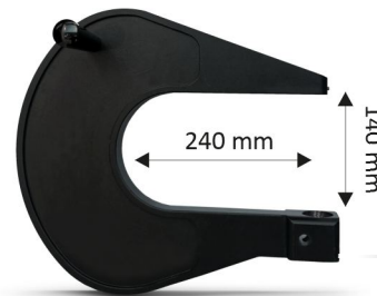
C-frame Made in steel Depth 240 mm, usable on standard piston.