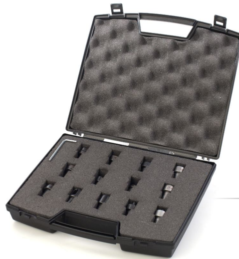
Suitcase with specific dies for: Ford, Land Rover, Mercedes, Bmw, Jaguar, Maserati, Porsche, Audi Volkswagen