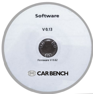
Built in software with end of riveting processing proof traceability certificate.