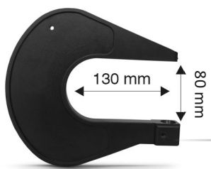
C-frame Made in steel Depth 130 mm, usable on standard piston.