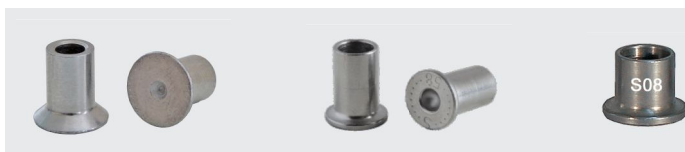
Flow form rivets